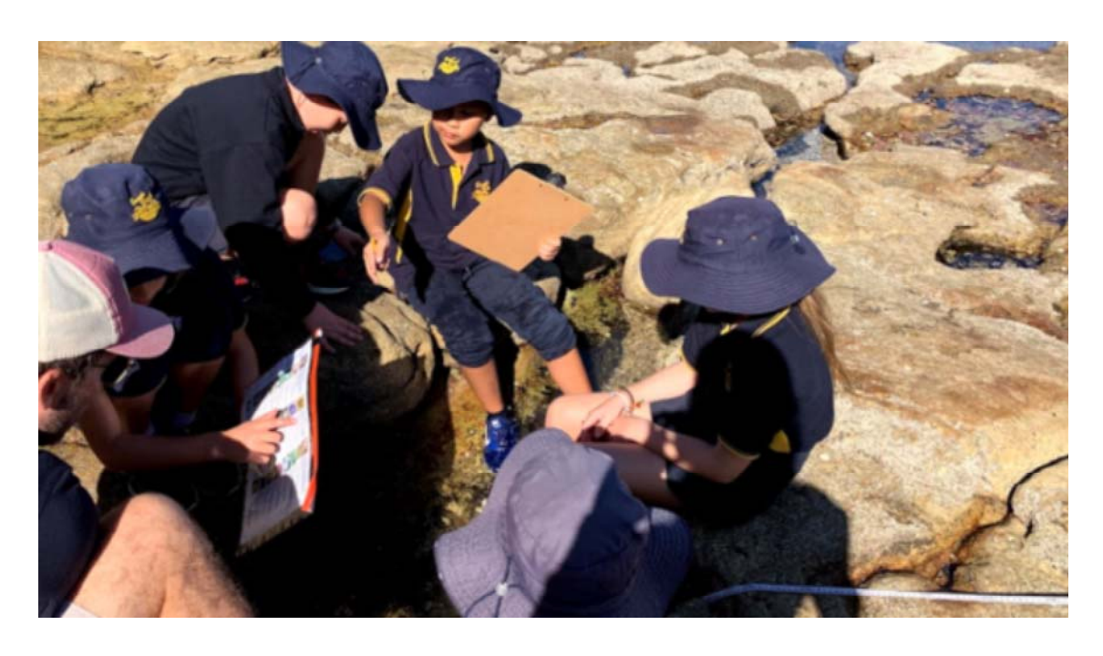
Science - Marine Discovery Excursion